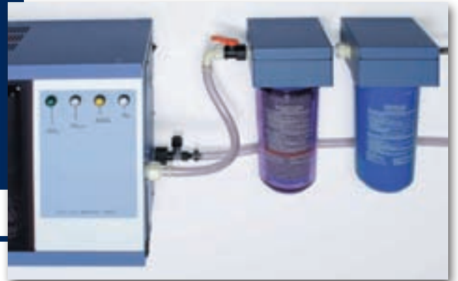
Aquatron® connected in series with ADH deioniser and AFH filter