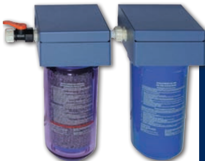
Deioniser and filter connected via ALC and fitted with wall mounting brackets